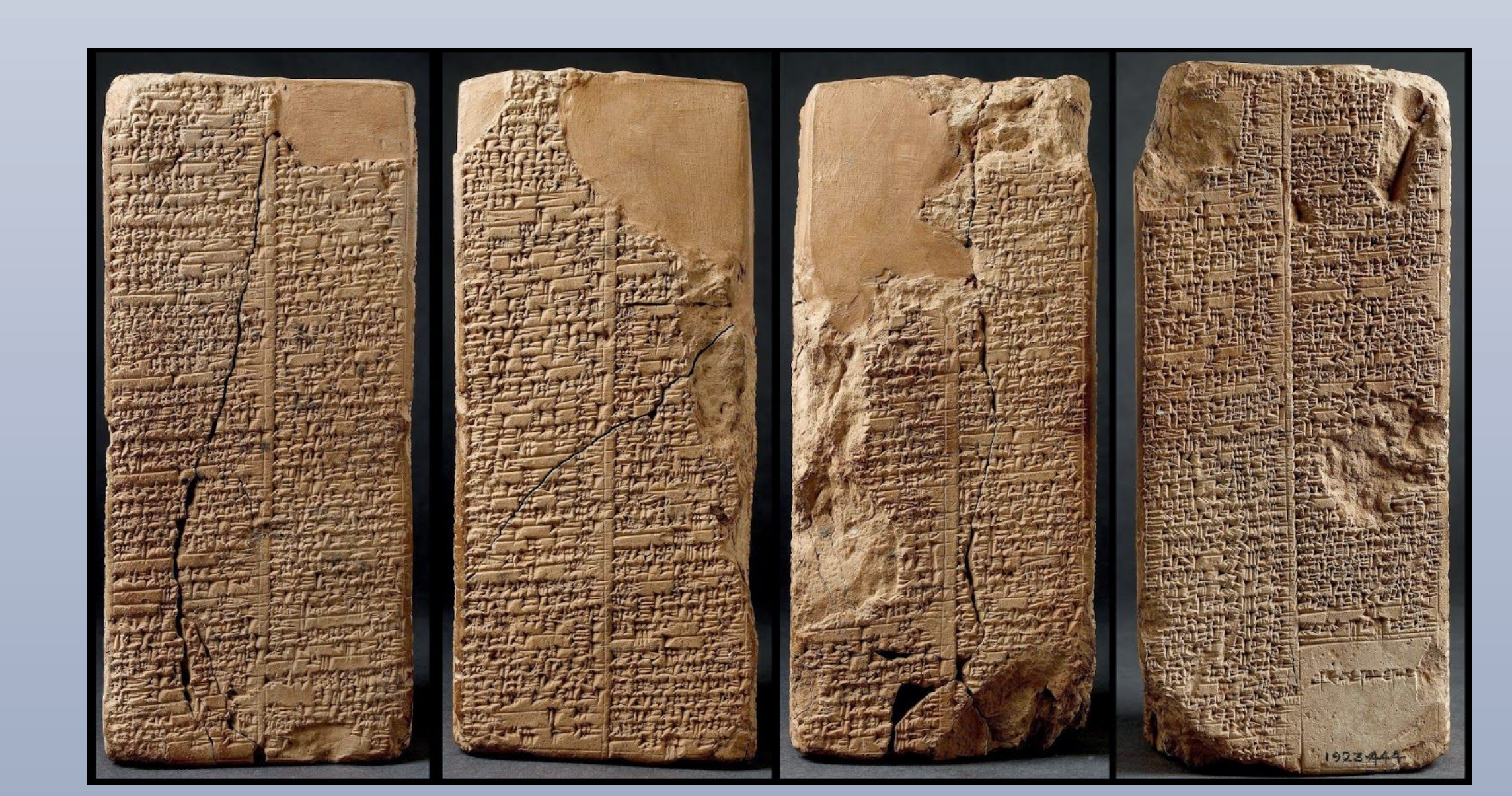
Four of the Tablets of Enuma Elis.

In addition, learning about a religion that I had previously never interacted with, Enuma Elis, gave me a new perspective on some ancient civilizations and how similar yet different the people of those times were to us.